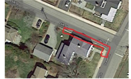
Gravel Street at Clift Street

There are 650,000 linear feet of sidewalks in the Town with distressed areas resolved on a rolling basis as budgeting allows in the Town's Capital Improvements Plan or "CIP." For insight into Capital projects peruse the user-friendly town budget found on the Town website at: www.groton-ct.gov/budget/fye2021-adopted