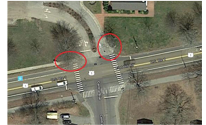
Poquonnock Plains Park Entrance