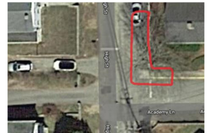
Academy Lane at High Street